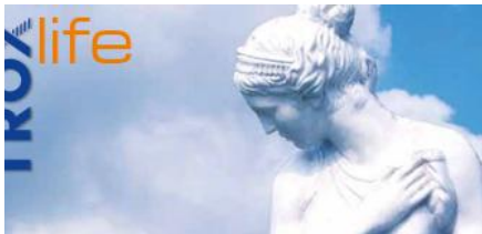
MUSEUM AIR. THE ART OF HANDLING ART.