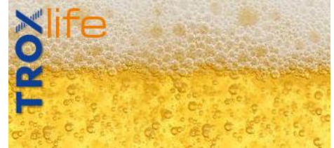
NO. 11: FOOD AND DRINK. AIR PURITY IN BREWERIES.