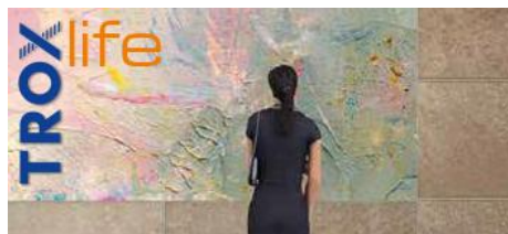
NO 12: ARTS AND CULTURE. ARTFUL AIR DESIGN