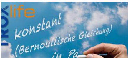
EDUCATION AIR. FOR HIGH MARKS IN THE CLASSROOM.