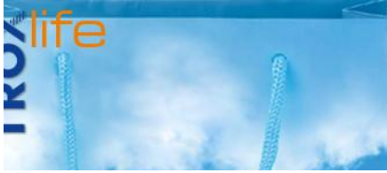
NO. 10: SHOPPING AIR. HOP 'TIL YOU DROP IN FRESH ROOM AIR.