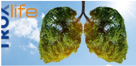
NO 20: AIR + HEALTH. AIR IS LIFE.