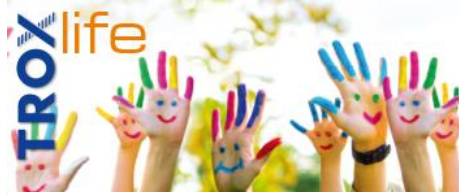
NO 22: SCHOOL + VENTILATION INTELLIGENT VENTILATION TECHNOLOGY NEEDS TO CATCH