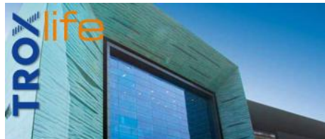
EXHIBITION AIR. ARCHITECTURE NEEDS TO BREATHE.