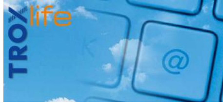
OFFICE AIR. FOR A CLIMATE OF EFFICIENCY.