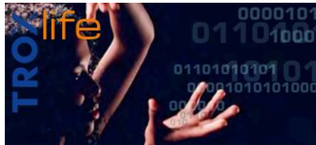
NO 16: ONES AND ZEROS. DIGITAL TRANSFORMATION.