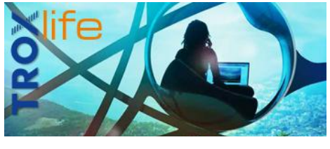
NO 18: COUNTRY AIR, CITY AIR. URBANISATION AND THE CONSEQUENCES.