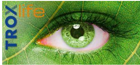
NO 19: SUSTAINABILITY. SUSTAINABILITY IS THE FUTURE.