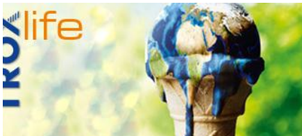
NO 17: CLIMATE AND CHANGE. NEW CHALLENGES FOR THE HVAC INDUSTRY.