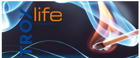
NO 15: SOUND AND SMOKE. CONTROLLING THE SPREAD OF NOISE AND SMOKE.