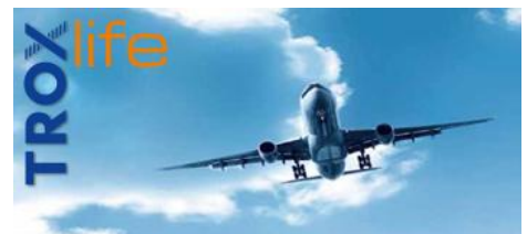
AIRPORT AIR. THE ART OF HANDLING AIRPORT