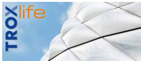
STADIUM AIR. STADIUMS AND THEIR PARTICULAR FLAIR