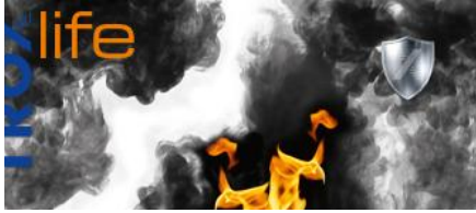
NO 23: FIRE + SMOKE PROTECTION AND SMOKE EXTRACT SYSTEMS.