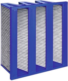
ACTIVATED CARBON FILTER INSERT, TYPE ACFI