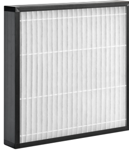
Z-LINE FILTER, CONSTRUCTION PLA